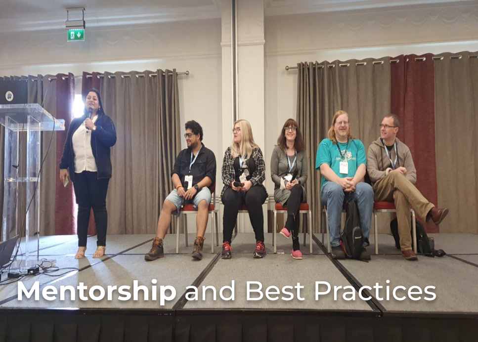
Mentorship and Best Practices