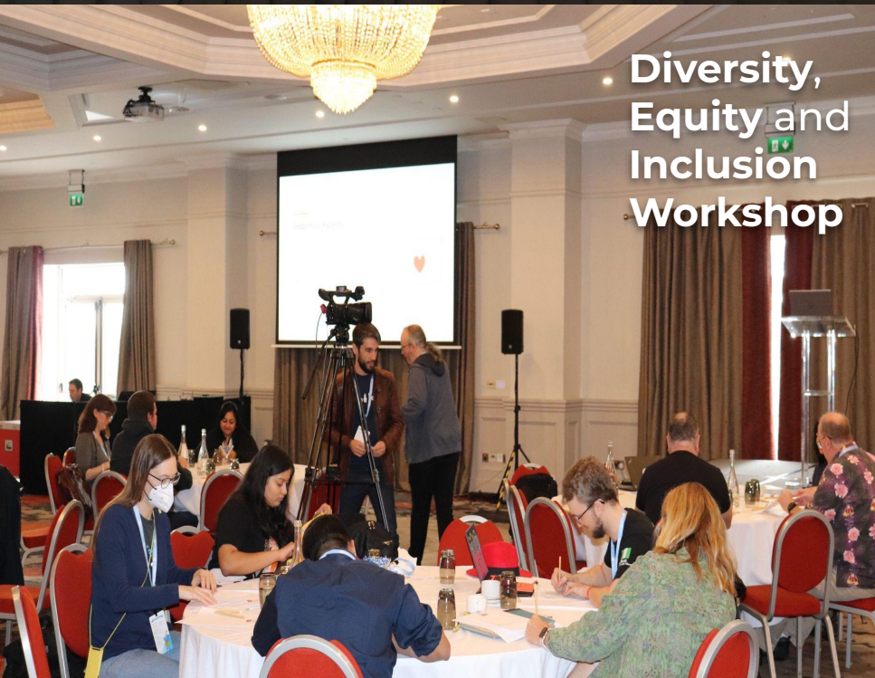
Diversity, Equity and Inclusion Workshop